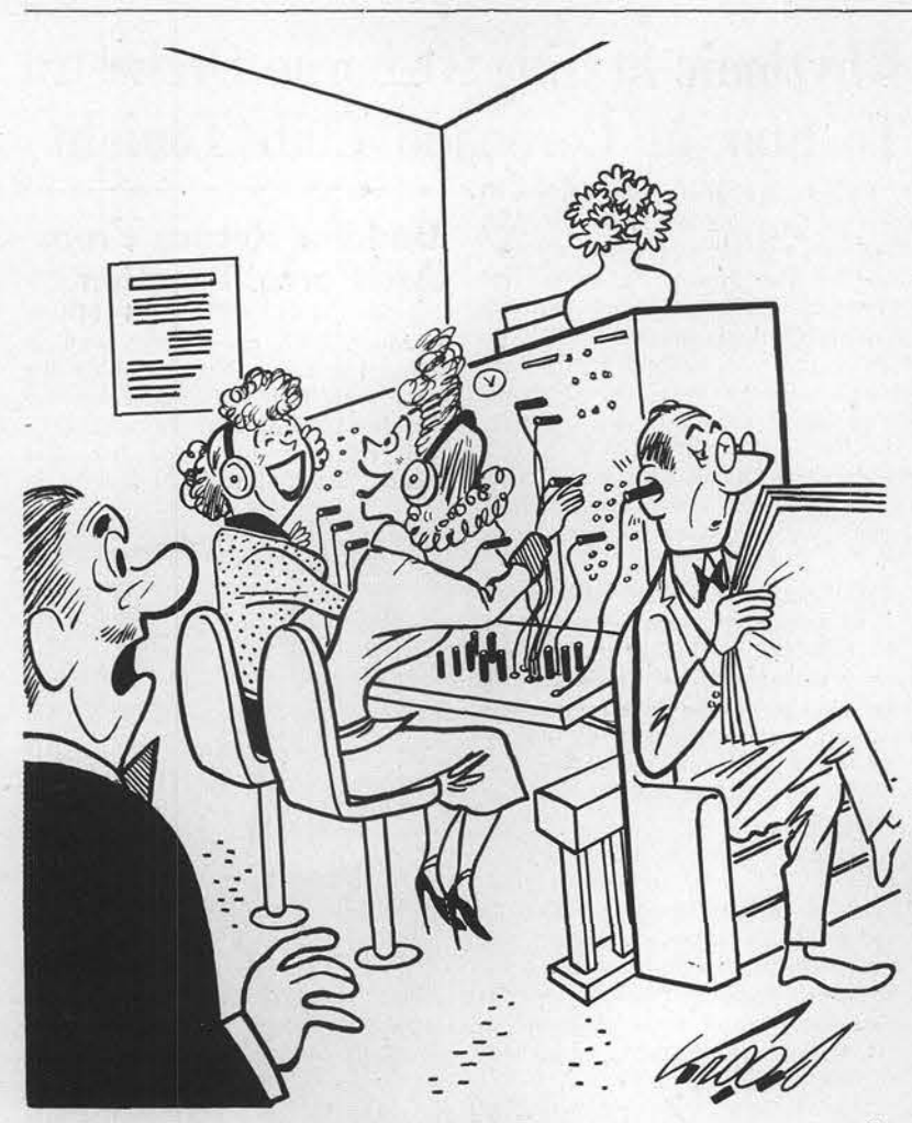
"PLEASE MISS KLOTZ, PAY MORE ATTENTION TO WHAT YOU'RE DOING!"